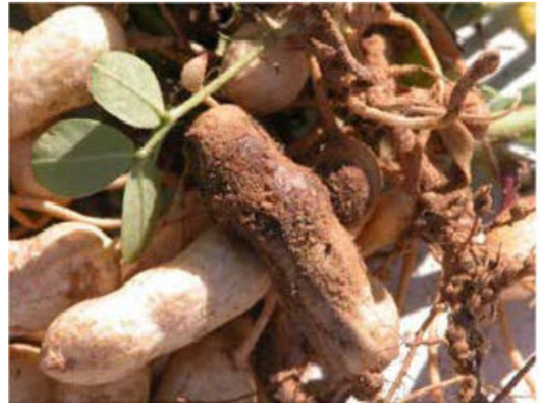
Figure 1. Symptoms of Pythium pod rot

Preventative fungicide applications are generally administered 60 to 90 days after planting; however, early initial applications may result in the need for an additional application late in the season if conducive environmental conditions persist. Several factors must be considered when applying pod rot fungicides: