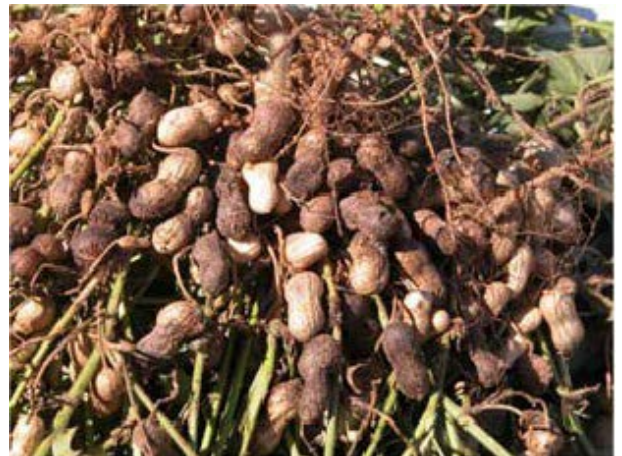
Figure 2. Symptoms of Rhizoctonia pod rot

4. Application Method - The activity of these products can be increased substantially when applied via chemigation; however, the banding of initial applications is often more cost effective. Broadcast applications result in fungicide treating bare ground which may be wasteful. Increasing carrier volumes (>20 gallons per acre) will improve deposition into the lower canopy, especially when applying liquid Ridomil formulations (as that product binds very quickly to the leaf). Administering irrigation soon after fungicide applications will also help to redistribute fungicides deposited on the foliage and increase concentrations delivered to the pegging zone.